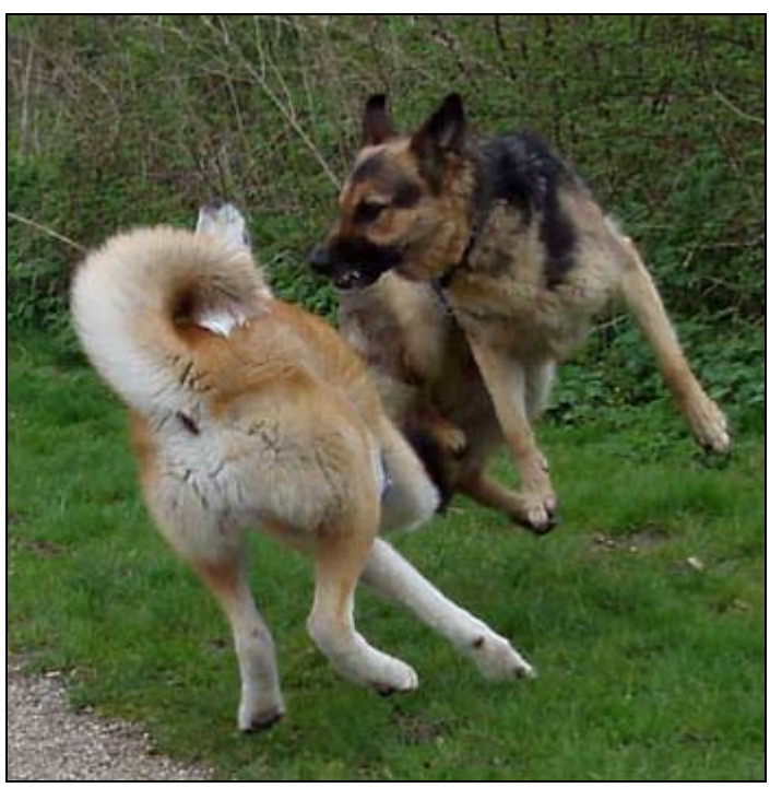
This looks serious but again this is also social play.