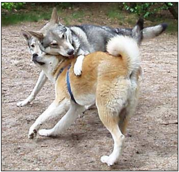
Playing dogs are often just determining who's boss

dog can learn to speak doggie language fluently. This is important in his development and can prevent aggression problems later in life.