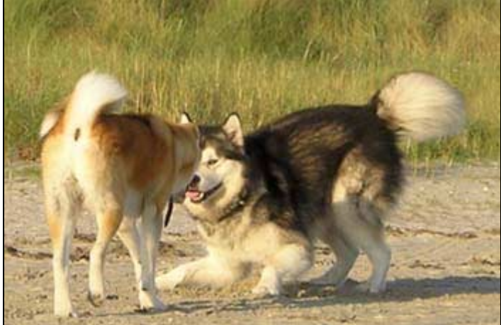
Japanese Akita and Alaskan Malamute showing dominant behavior (left) and a play invitation.